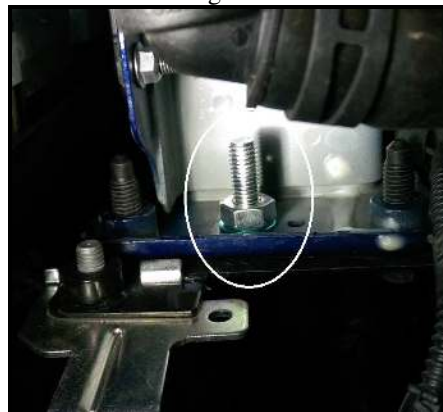
Picture C: Nut tightened down making a stud anchor for the front blue brackets.

Next add a small 10mm flat washer to each 10x40mm bolt and thread a 10mm nut to each bolt by hand as tightly as you can. Tighten the nuts using your two 17mm wrenches. We found that if we held the bolt with our fingers we could tighten the nut with only our ratcheting wrench and not have to have a wrench on the bolt head.